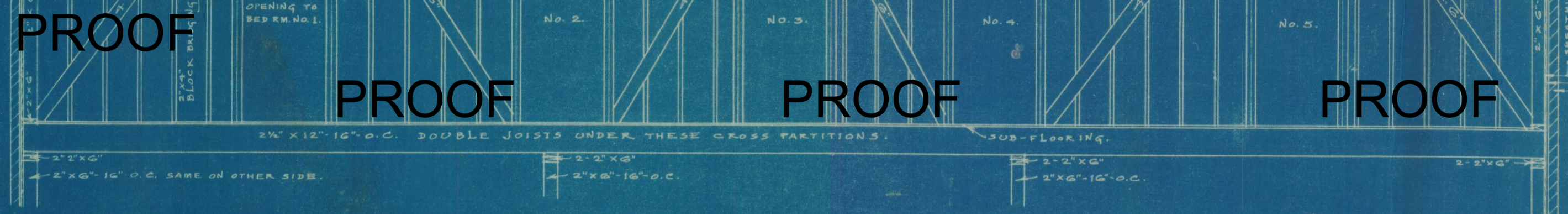
1/4" SCALE DETAIL SHOWING FRAMING OF CROSS PARTITION ON SECOND FLOOR