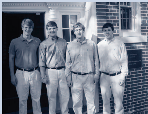
New DKE officers