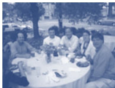
3 Dekes & guests at a party