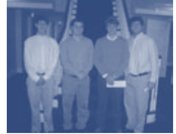
New Chapter Officers