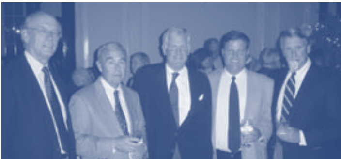
Brothers enjoy returning to DKE for Alumni Weekend.