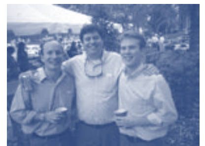
BBQ before game