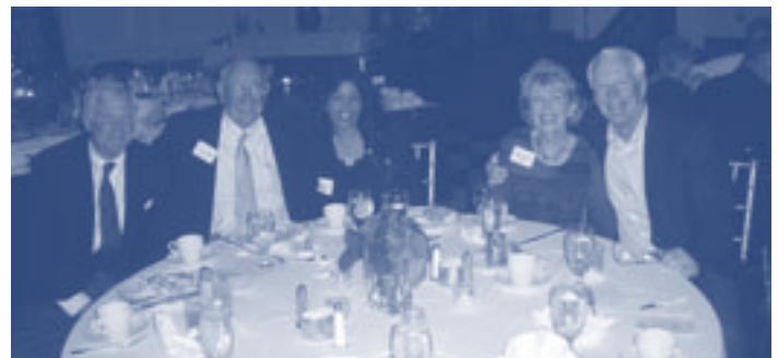
Just like the old days... dinner is better with some pretty girls at the table!