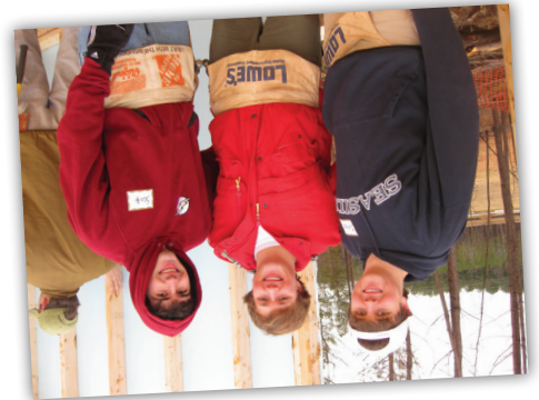
DKE brothers complete largest Habitat for Humanity project in Orange County history!

What does the future hold for Beta Chapter? Find out inside!