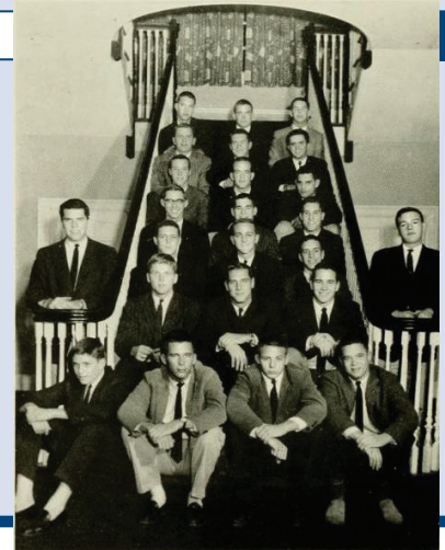
Right: 1959 Pledge Class

Send the best photos from your era to our editors for possible publication. You can email them to content@affinityconnection.com (mention DKE at UNC).