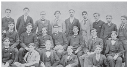
Beta Chapter, 1894

Delta Kappa Epsilon was founded on the UNC campus in 1851 and is recognized as the first fraternity at the university.