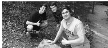
DKE brothers took a trip to Battle Park to earn house points for the Greek Green Games.

Currently, we are ranked fourth among fraternities in a campus-wide sustainability competition, the Greek Green Games. Participants can earn points by taking action to make a difference on campus and become more environmentally friendly over the course of the school year in six categories: Waste; Energy; Water; Social, Physical, and Mental Sustainability; Education; and Events.